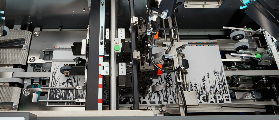
Clear paper path and easy access