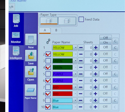
IMBF - Continuous production