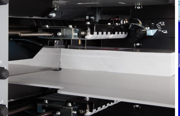
Accurate and reliable A.M.S.+ Suction Feed System