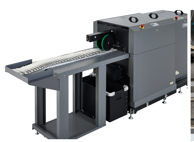
Optional DKT-200 Trimmer with Conveyor