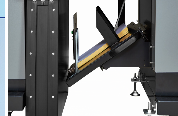
Corner and Side stitched booklet Stacker